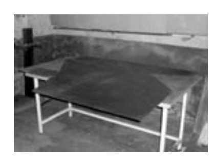
Bells, acier, plastique, 06